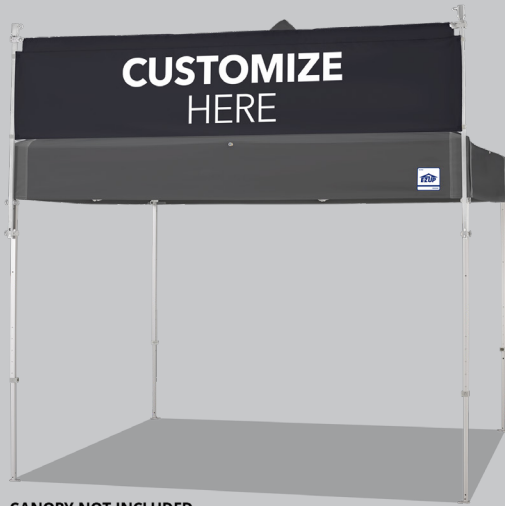
CANOPY NOT INCLUDED

The Marquee Banner instantly elevates your messaging and boosts the visibility of your brand. This fully customizable and easy to install banner extends above your canopy making your setup shine at farmers markets, sporting events, festivals, and beyond.