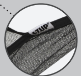
Mesh and Binding