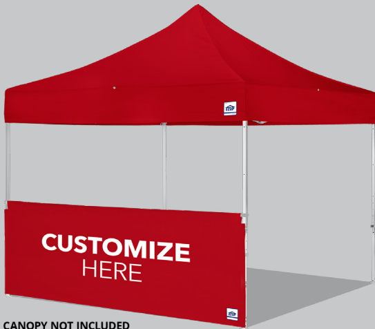
CANOPY NOT INCLUDED