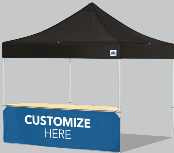
CANOPY NOT INCLUDED

Creating your perfect service booth is now easier than ever. The adjustable Canopy Counter/Bar Top quickly attaches to your canopy, instantly providing a functional countertop. Ideal for serving food or drinks, checking in guests at events, or displaying products at trade shows.