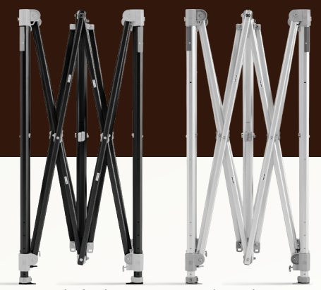
Matte Black Aluminum